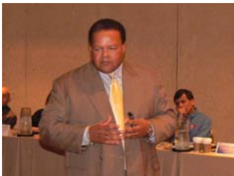
Rudy Crew, speaking to LEADS members on day two.

O n January 17-18, 2008, we held a dynamic leadership session for LEADS superintendents and liaisons from 8 of the 11 LEADS districts. The one-and-a-half day session, held in Miami, was co-hosted by Miami-Dade County Public Schools (MDCPS) and SRN LEADS. The session began with dinner hosted by MDCPS at a South Beach restaurant with fantastic views of the water. MDCPS administrators sat with participants to talk about the district, preparing us for the second day.